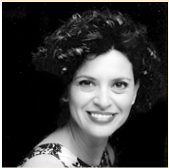
Trudy Faust Advertising & Subscriptions