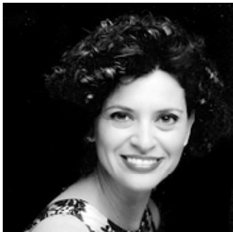
Trudy Faust Advertising & Subscriptions