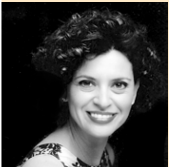
Trudy Faust Advertising & Subscriptions