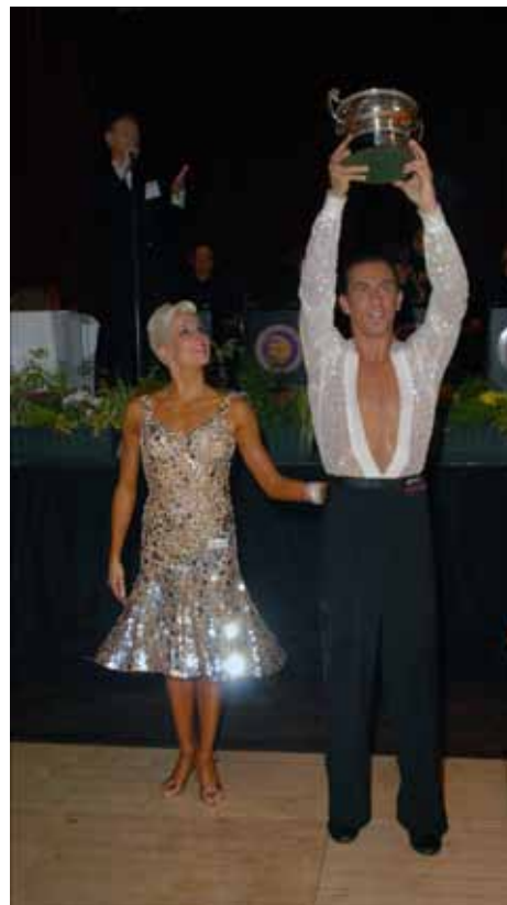
they had eaten one to many puddings.....

The semifinal was exciting but I must say I could not believe some of the couples who made it.....at this level you need to look great, be in shape and have all your bases covered. There were a few dancers who made it a long way in this competition who looked like