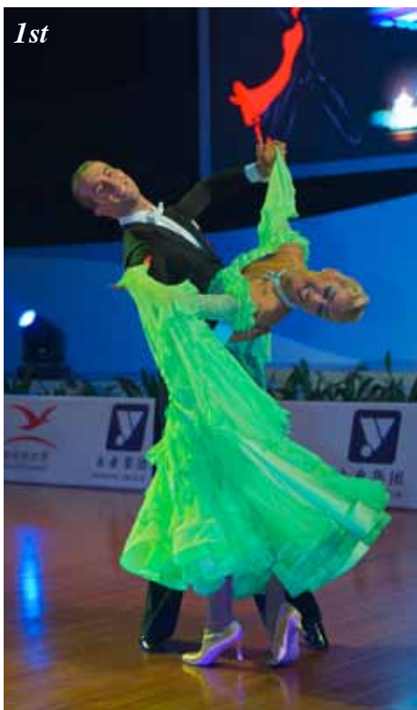
Moscow two weeks before the championship?